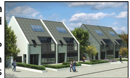
The Glasgow House (Artist's Impression) - GHA, PRP, City Building