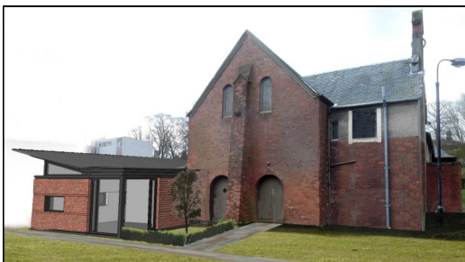
Proposed Design by Austin:Smith-Lord